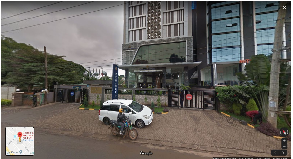
Fig: Golden Tulips entrance on Google Maps

Under universities, Kenyatta University main campus and University of Nairobi Chiromo campus scored above 80%.